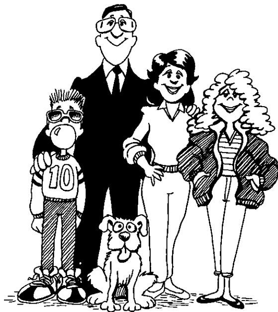
COVENANT LOVE MEANS ACCEPTING THE DIFFERENCES AND UNIQUENESS OF EACH FAMILY MEMBER.

but perfect love casts out fear" (v. 18). God expresses perfect love, and we can respond in love because God loved us first (1 John 4:19).